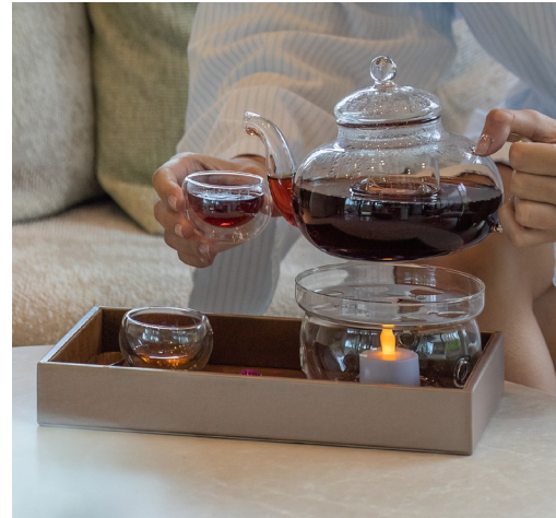
SPA & WELLNESS EDIT - SOUND MASSAGE

Resident and visiting wellness practitioners offer bespoke holistic treatments and exercise programs focusing on creating a positive effect on your health and wellbeing. This is followed by a sound massage using Tibetan Singing Bowls to help to balance your chakras and to promote a state of tranquility to retune your body, mind and spirit, encouraging relaxation and healing.