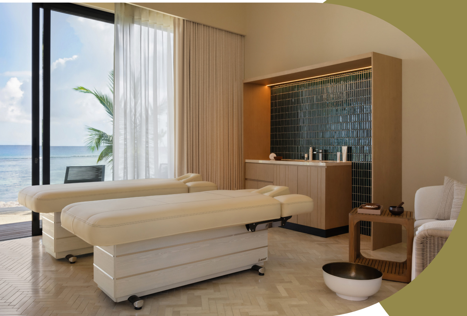
SPA & WELLNESS EDIT - THE BODY EDITION - SPA ROOM COUPLE