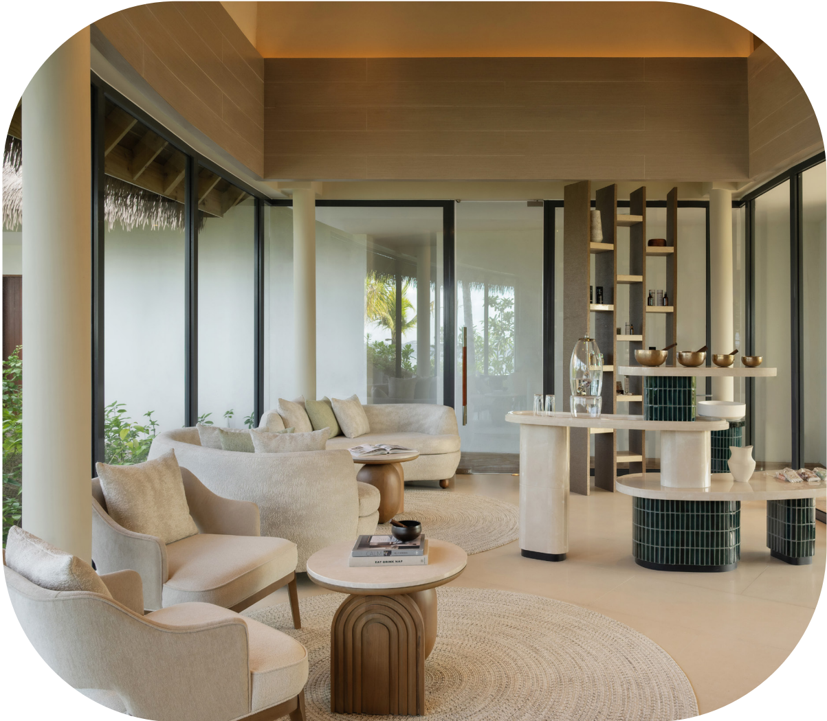
SPA & WELLNESS EDIT - THE BODY EDITION - MIRACLE MORINGA LIMITED EDITION

The treatment combines our Rejuvenating Facial and Miracle Moringa Massage for the ultimate experience to feel revived, refreshed, and glowing. It combines 2 powerful healing elements, Moringa and Clear Quartz Crystal, a “master healer” because it amplifies positive energy, in order to create a unique healing treatment that stimulates the immune system and restores balance to your body. Features a Moringa foot bath to soak away your tension, a body scrub,