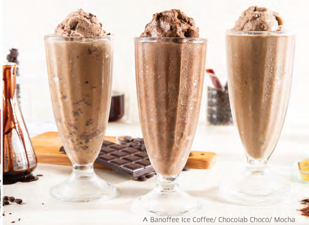
^ Banoffee Ice Coffee/ Chocolab Choco/ Mocha