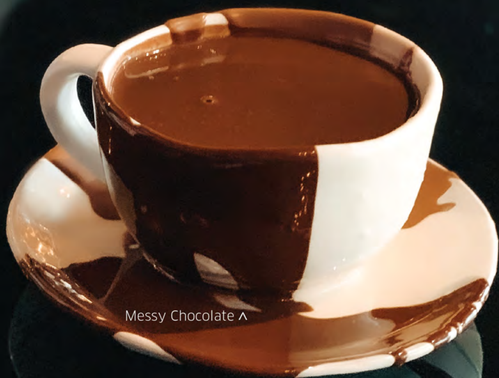
Messy Chocolate ^