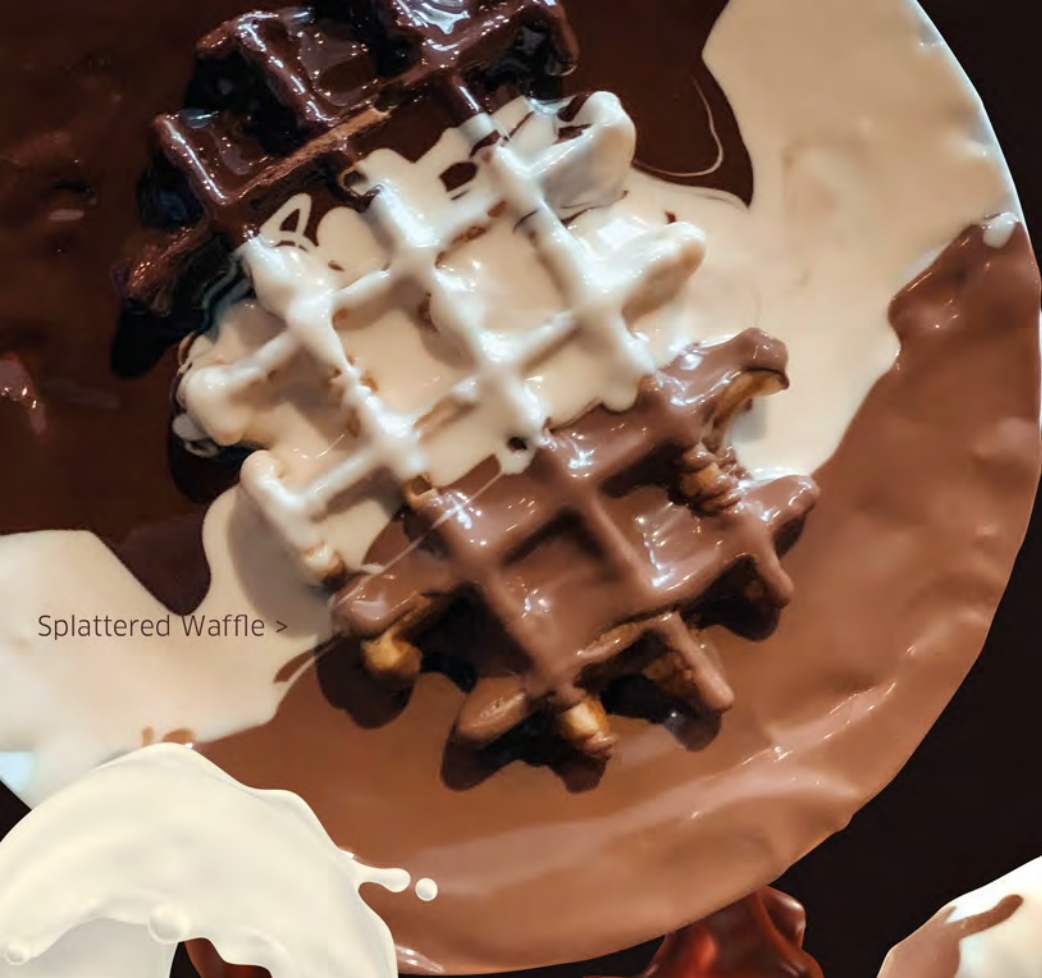
Splattered Waffle >