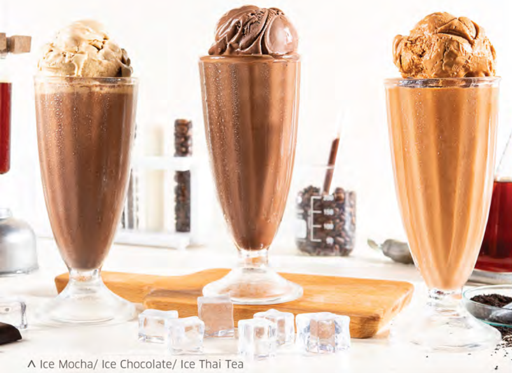
^ Ice Mocha/ Ice Chocolate/ Ice Thai Tea