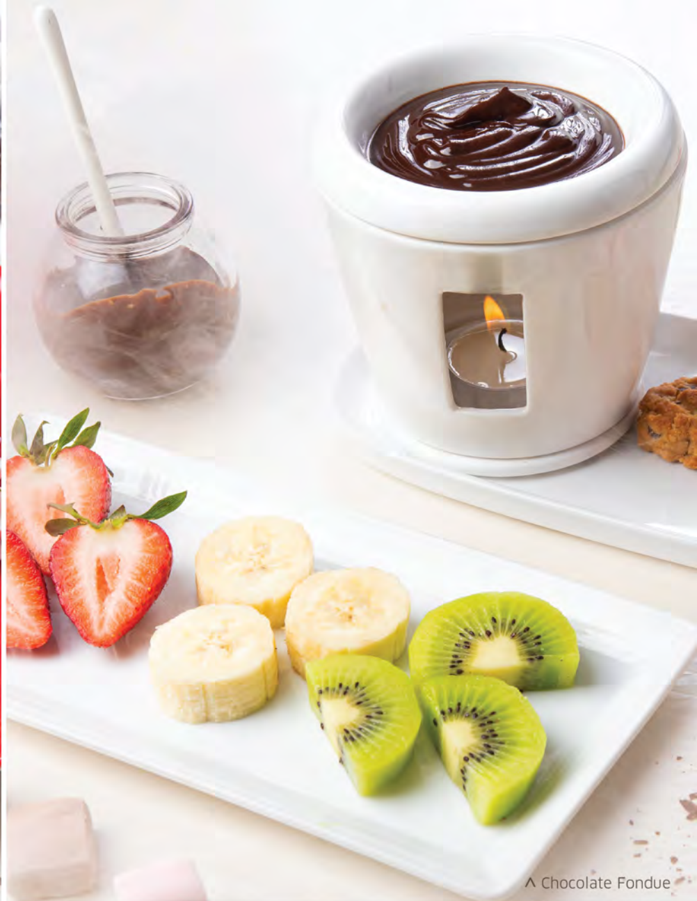
^ Chocolate Fondue