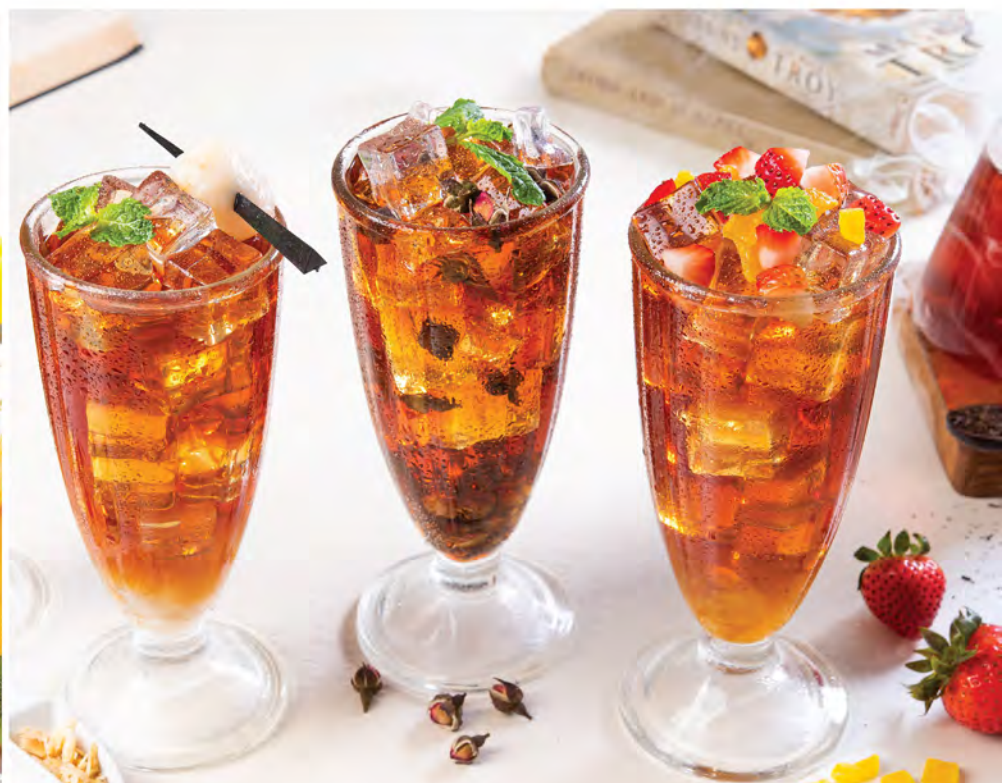
^ Lychee Almond/ French Vanilla & Rose/ Mango Strawberry