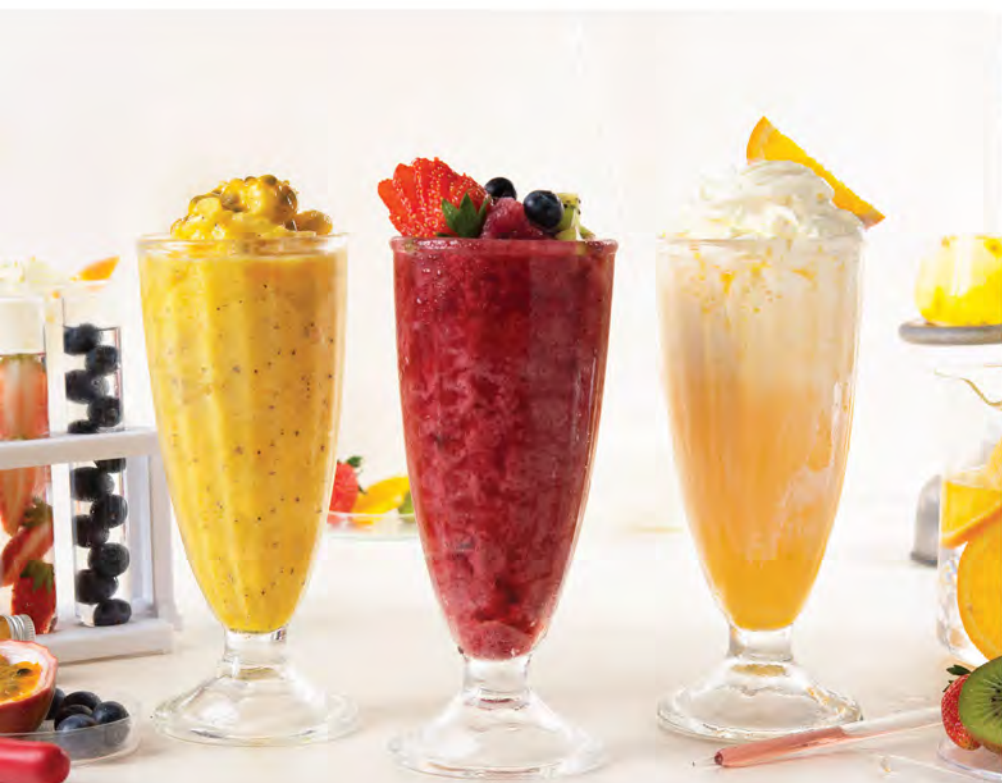
^ Passion Fruit/ Mixed Berry/ Creamsicle

Allow us to fulfil your needs -please let one of our ambassadors know if you have any special dietary requirements, food allergies or food intolerances.