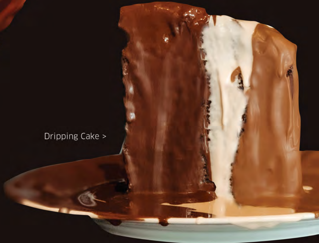
Dripping Cake >

Allow us to fulfil your needs - please let one of our ambassadors know if you have any special dietary requirements, food allergies or food intolerances.