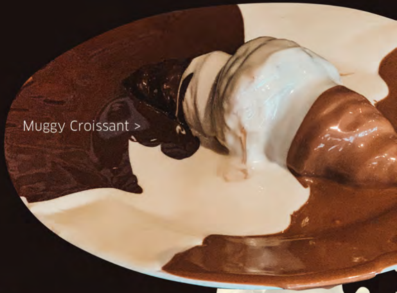
Muggy Croissant >