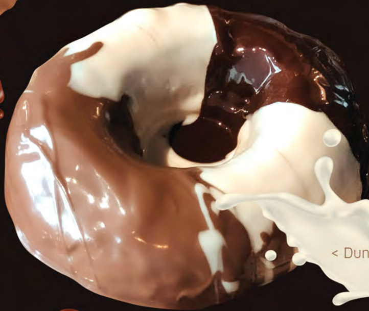
< Dunked Donut