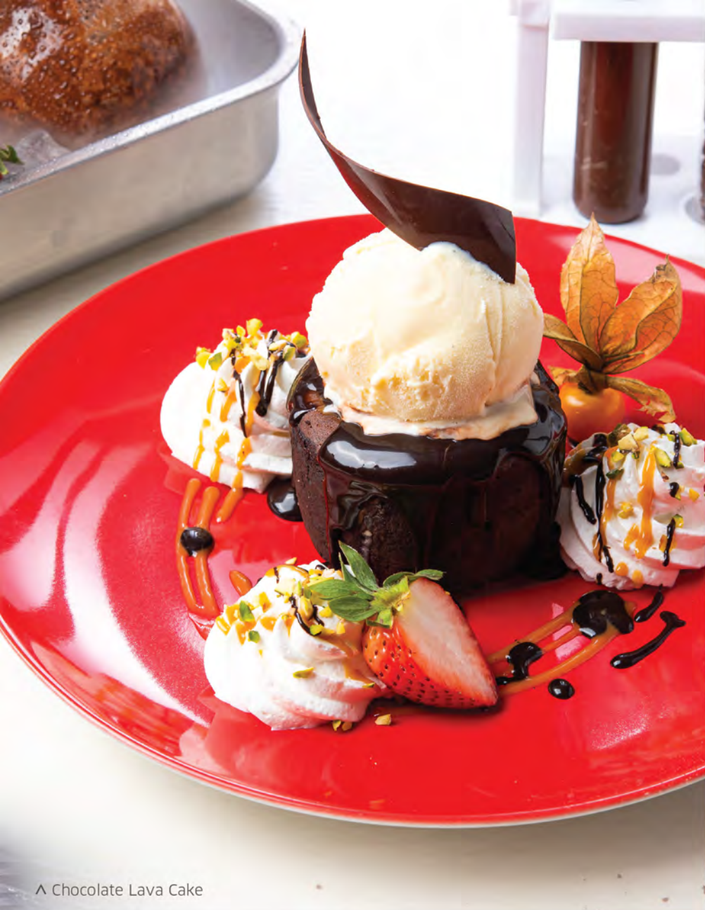
^ Chocolate Lava Cake