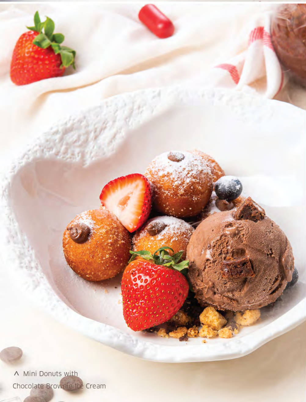
^ Mini Donuts with Chocolate Brownie Ice Cream