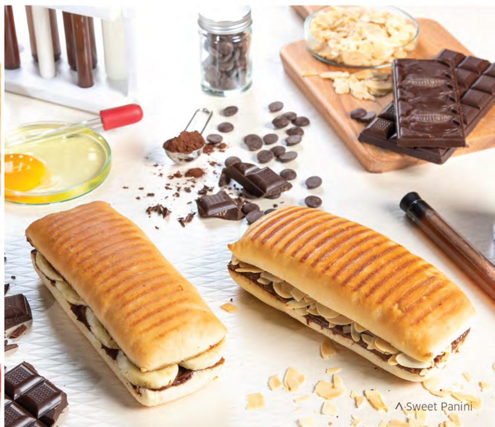
^ Sweet Panini